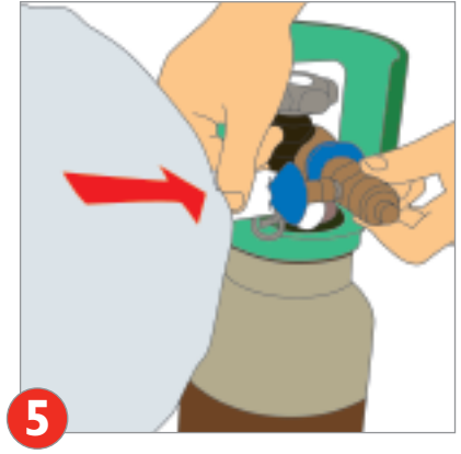
If using foil inflator, hold neck of balloon over nozzle and push back, release when balloon is inflated to correct size.