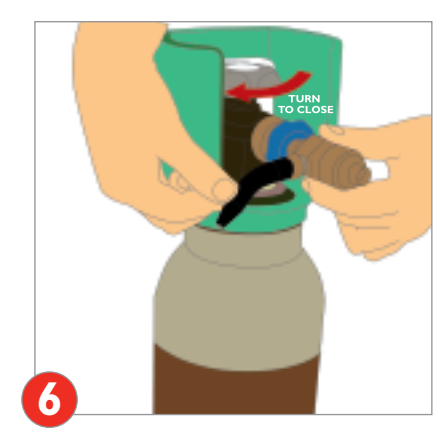
After inflation close cylinder valve then push tip to release surplus gas.

If the equipment is leaking or you have any concerns about how to use this equipment, call BOC on 0800 III 333 or visit our website www.bocballoongas.co.uk