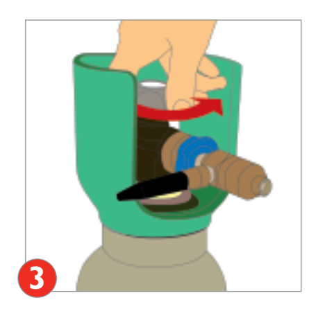
Slowly open cylinder valve.